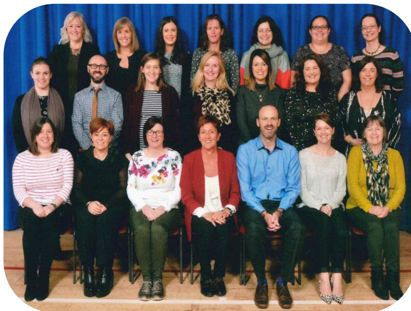
TEACHING STAFF – 2018-2019